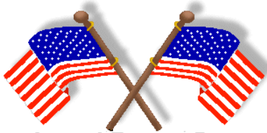
Armed Forces Day

Armed Forces Day is Saturday, May 20th. We thank our God for His defense through the men and women of our Armed Forces. Please keep them in your regular prayers.