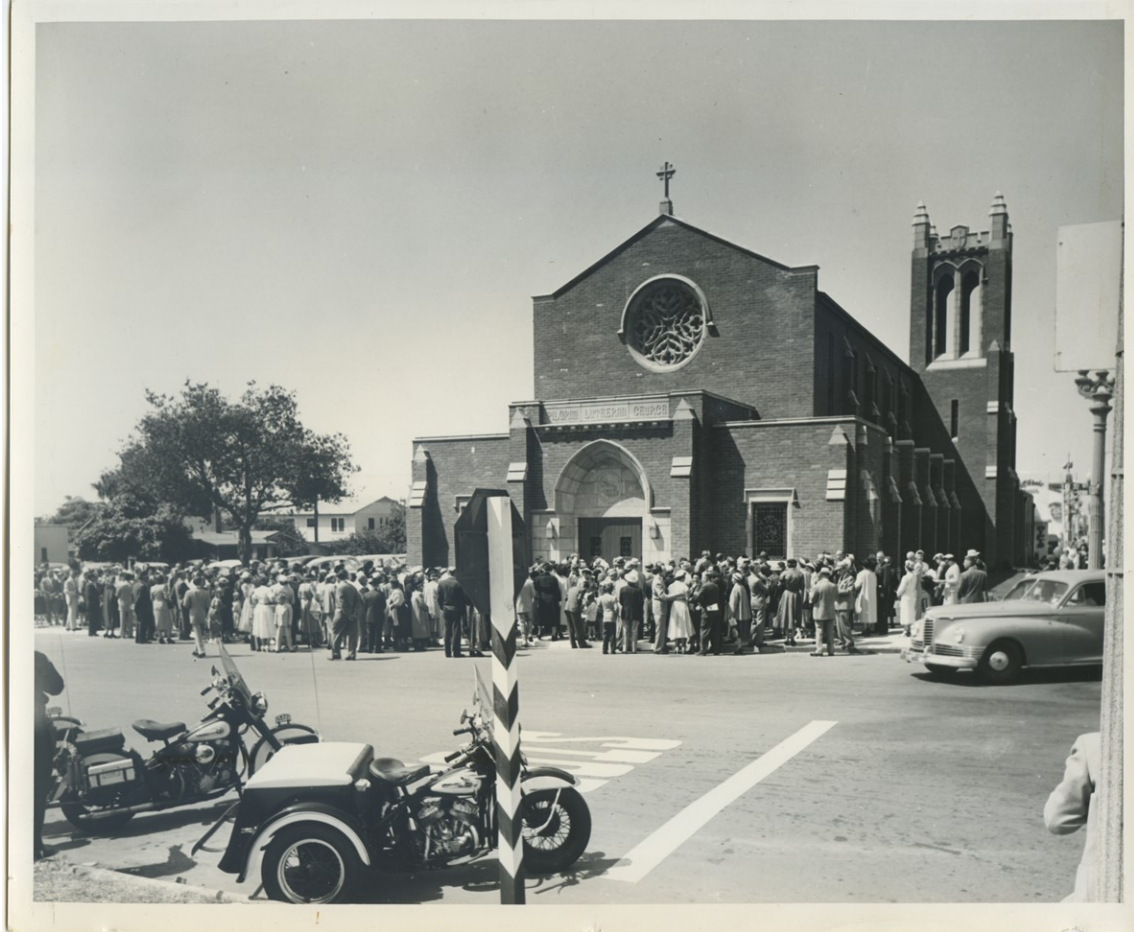
(Pilgrim's First Church Building was on 14th & Arizona Ave in Santa Monica)

Pilgrim Lutheran Church 1730 Wilshire Blvd. Santa Monica, California 90403